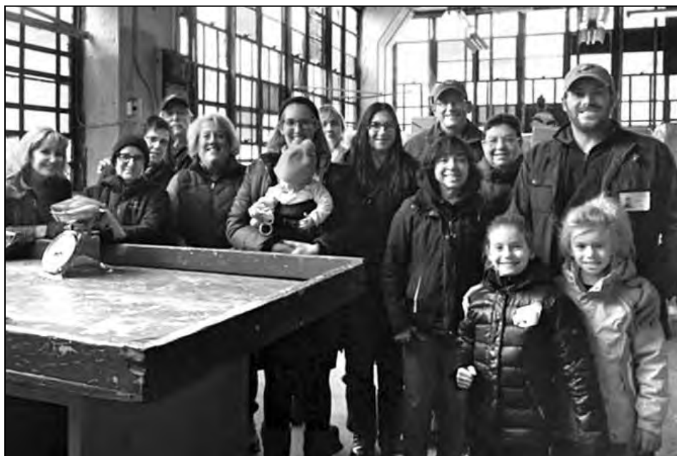
ABOVE: This mighty group of Kol Ami volunteers packaged 618 two-pound bags of sweet potatoes in an afternoon at Share Food. The sweet potatoes were included in Thanksgiving food boxes provided to those in need. Join us on March 15 for our next volunteer afternoon (1:00-3:00 p.m.) at the Share Food Program.