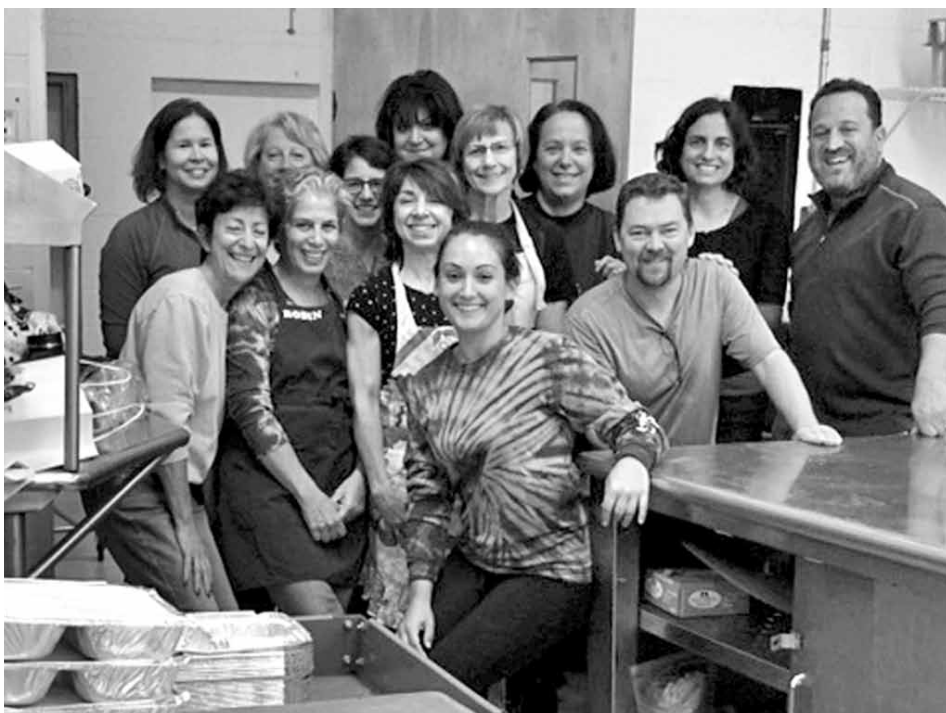
COOK FOR A FRIEND IN THE KOL AMI KITCHEN – The group made 94 lasagna meals! Join them on February 28 when they plan to make vegetable soup! ■