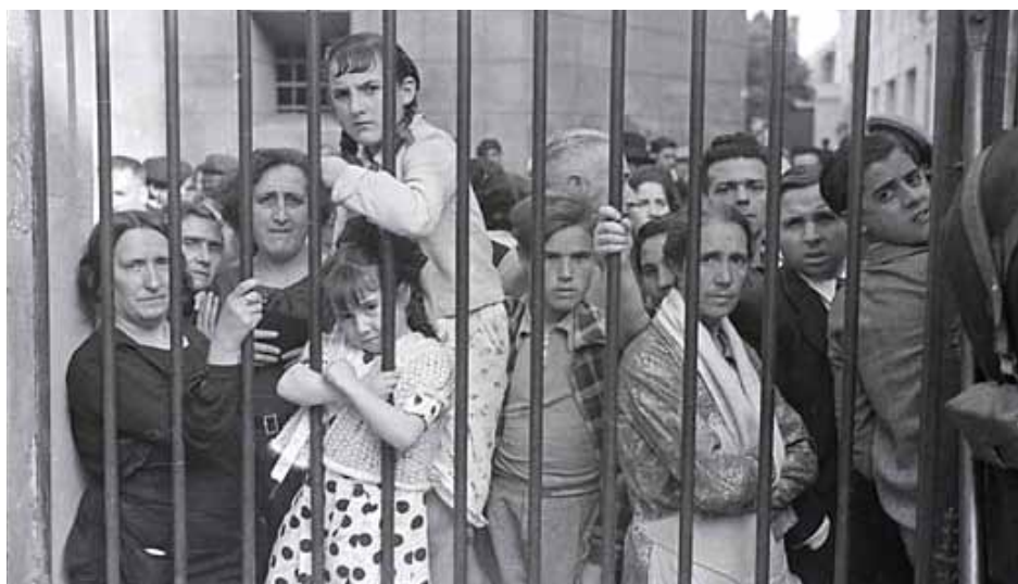
CROWD OUTSIDE MORGUE AFTER AIR RAID, VALENCIA - MAY 1937

The photographers were in the thick of it all: with soldiers in battle, mothers nursing babies, children playing in streets of rubble, priests saying Mass, and workers in fields. The photos appeared in American and European magazines during the war, depicting Nationalist and Republican leaders and their supporters, soldiers, and spies. The images also show people trapped in a war that altered their lives considerably, or ended them quickly from the sky or slowly on the ground.