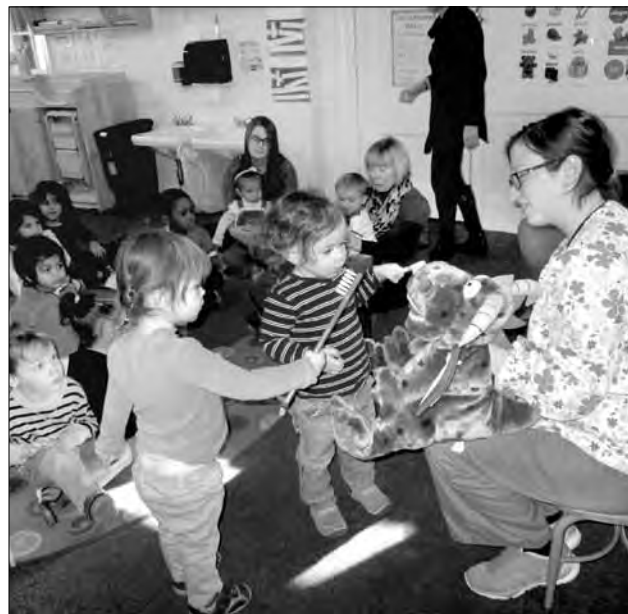
DENTAL AWARENESS MONTH: The children learned about taking care of their teeth and gums.

BELOW: On Sunday, January 31, the “New Members” brunch was held. This was a great opportunity for them to meet one another and to mingle with our president, rabbi, and members of the Membership Committee.