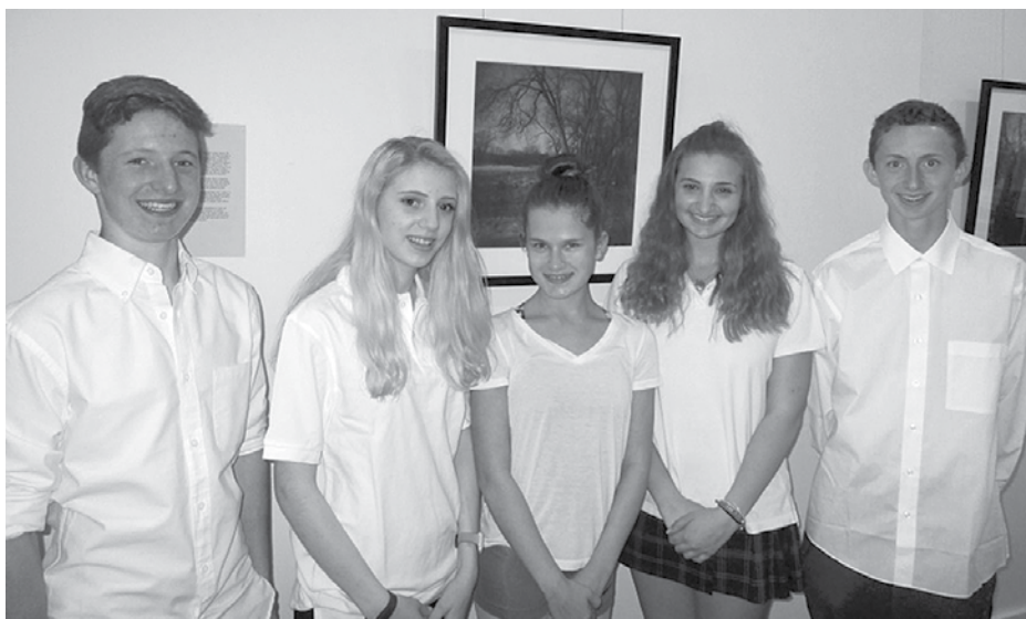
NOT PICTURED - EFRON LEVINE DANZIG

We will rejoice with the following students and their families at a creative service that includes the students' thoughtful writings about Jewish identity, their values, the people who have inspired them, the world around them, and how they envision their future: