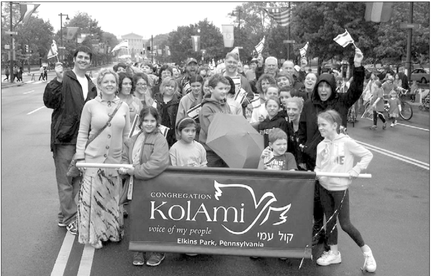
Kol Ami students, their parents, and some congregants recently sang and marched in the Israel Independence Day Parade, a city-wide celebration of Israel's 65th birthday.

Contact Rabbi Holin for more information at 215-635-4182.