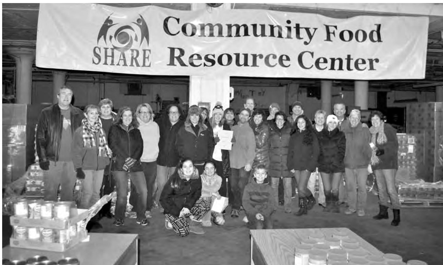
Together, this group took time to SHARE on Sunday, January 11, packing over 320 boxes of nutritious food in 1½ hours! SHARE provides food to over 20,000 low-income families each month.