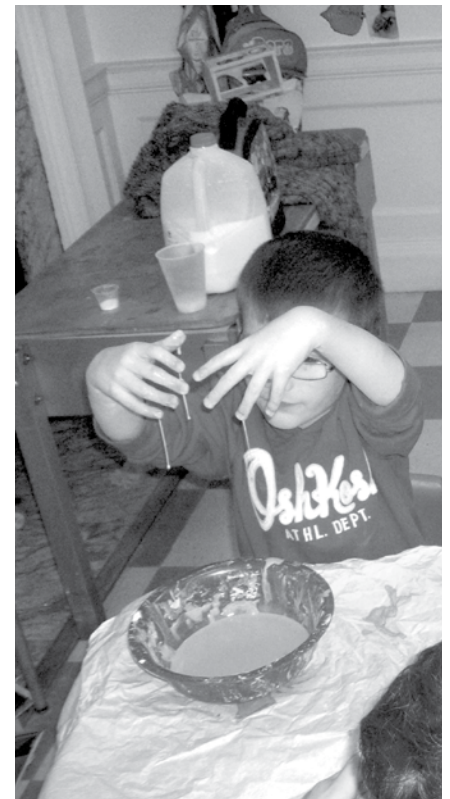
AN EARLY LEARNING CENTER CHILD MAKES NOT-SO-MESSY OOBLECK (GOOP) AS AN INDOOR WINTER ACTIVITY.